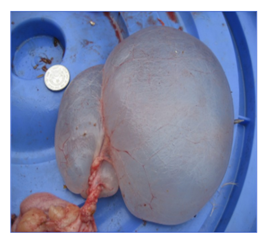
Figure 3: A thin walled cystic oviduct

In a large number of these 'false layers' a new variant of IBV was detected; early infection with this variant has been seen to result in a failure of the oviduct to develop, despite the other characteristics of sexual maturity occurring normally ( Figure 4 ). The GD – Animal Health Service in Deventer, Netherlands, has typed this IBV variant as D388. This strain has been confirmed as being identical to the QX-like variant, which was typed and described in China in 2004.