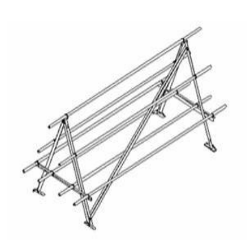
Figure 1: Examples of perches and platforms to be provided in rear

• Training of hens to use the nest should start early in rear, with the use of perches and/or platforms to stimulate jumping and nesting behaviour.