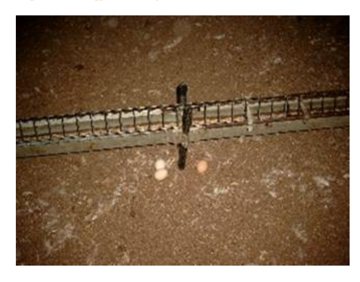
Figure 3: Floor eggs laid under feeder

Feeder equipment can also affect the occurrence of non-nest eggs. For example, if pan feeders are set at the wrong height or are not winched up following feeding, hens can lay eggs underneath them, while trough feeders positioned at the incorrect height can become a barrier to the nests. To prevent hens from laying eggs under them, feeders should be raised as soon as the feed is consumed. It is good practice to visit the flock at feeding time to monitor feeding progress and behaviour as many potential problems can be identified during such visits.