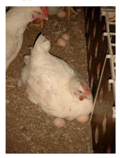
Figure 2: Pullet nesting by solid wall

Where automated systems are used, the egg gathering belts should be run several times each day, even before obtaining the first egg, so that the pullets become acclimatised to the sound and vibration of the equipment. It is good practice to initially run egg gathering belts slowly in conjunction with the operation of the feeders. After several days the egg collection system should gradually be run more often, increasing to several times during the morning and afternoon.