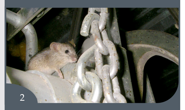
Live rodent sighting.