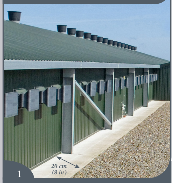
House aprons should extend at least 20 cm (8 in) outward.