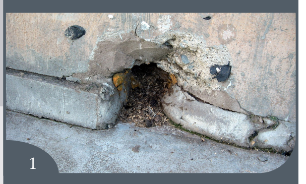
Burrows in house foundation.