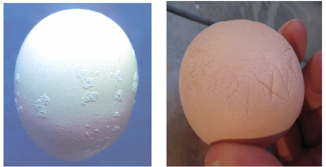
Figure 2: Examples of egg defects caused by IBV infection

The egg on the left has calcareous deposits and the egg on the right a soft shell.