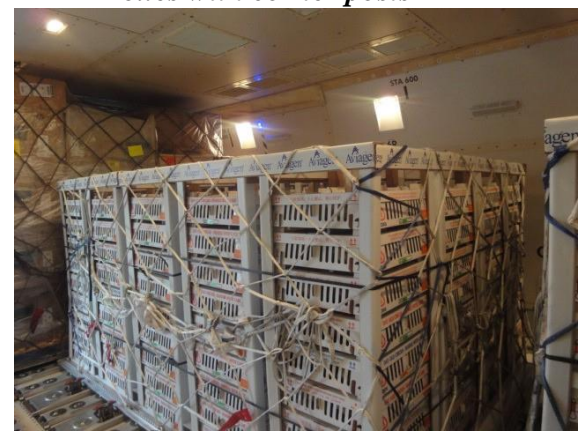
Boxes with corner posts

The air carrier or freight forwarder's personnel must palletize the DOC before loading them onto the aircraft. Boxes should be loaded onto pallets and secured with spacers between the stacks to stabilize them and to keep the boxes separated during transport thus allowing air movement in and around the boxes. For cardboard boxes, corner posts can be used to prevent the netting from damaging the boxes.