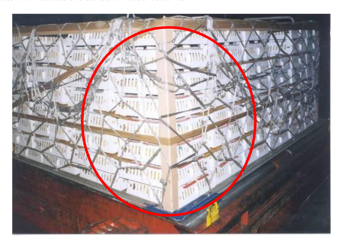
Example of a palletization plan for 4 different types of chicks

Make sure female and male boxes are evenly spread and NOT like here, where all male boxes with red lids are stored in the same corner.