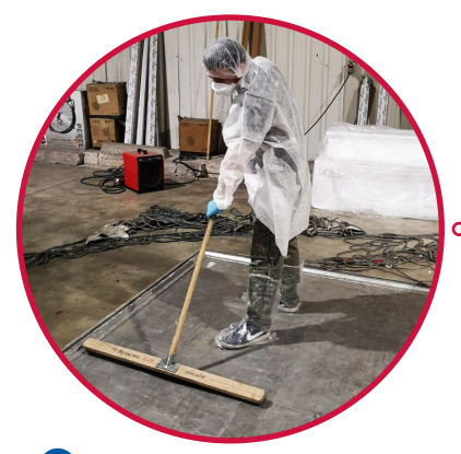
Sweep the aircraft pallet with a broom to clean off any debris.

Follow local and manufacturer's safety instructions for the use of disinfectant including the availability of the SDS (Safety Data Sheet).